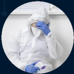
Disaster relief products