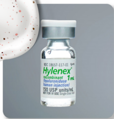
Pharmaceuticals & Medication