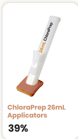
Chloraprep 26mL Applicators 39%