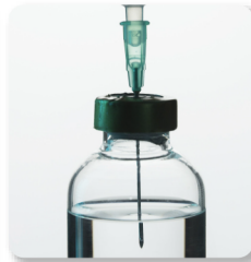
Fillers & Toxins