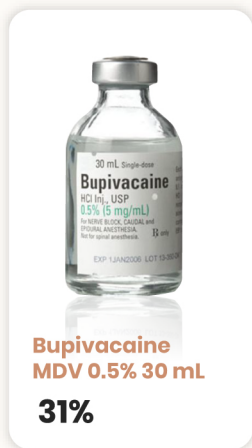
Bupivacaine MDV 0.5% 30 mL 31%