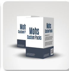
Buy Mohs Custom Packs