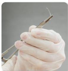
Sutures & Surgical Tools